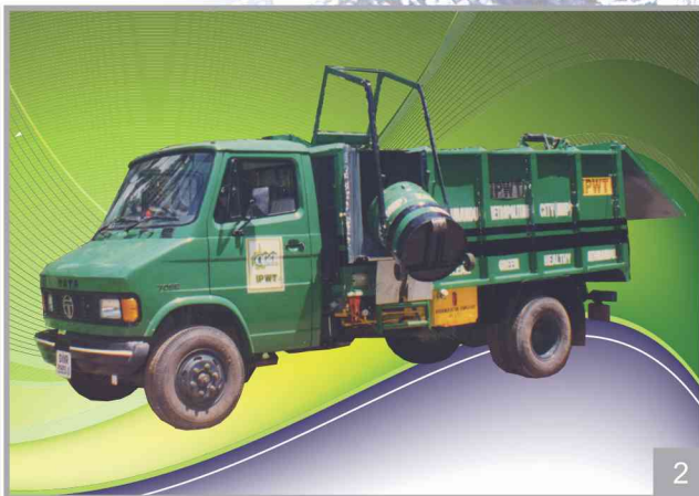
1&2. Mini-size SIDEPAK side loading 3 cylinder compactor (6m 3 ); on 9 ton GVW chasis supplied to Kathmandu ADB Loan-1240-NEP(SF).

IPWT, the renowned name in solid waste management systems, now offers the time and cost-saving, maintenance-free, vehicle-mounted, SIDEPAK® Refuse Collector.