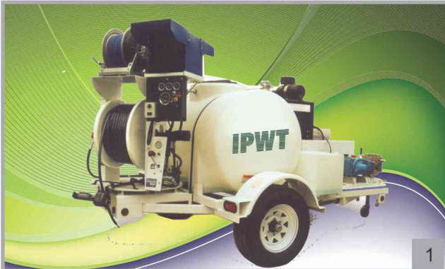
Conceptual design for Year 2011