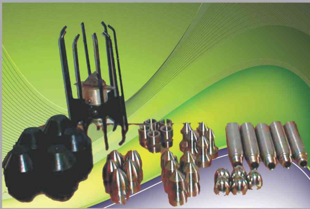
NOZZLES AND CUTTERS