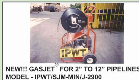
NEW!!! GASJET ® FOR 2" TO 12" PIPELINES MODEL - IPWT/SJM-MIN/J-2900